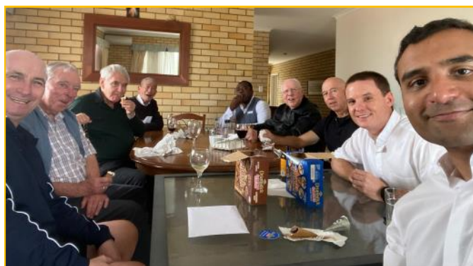
When I first arrived!