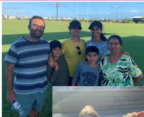
Aura Families gather to hear more about the proposed new school and enjoy our hospitality at the Community BBQ last Sunday.