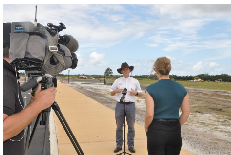
Media release at the new school site in Nirimba