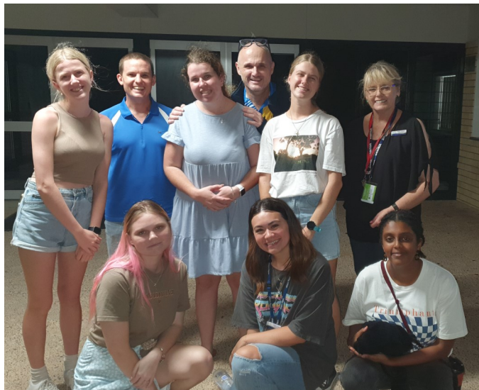
Here are some of the photos of the Kingdom of the Youth launch where 80 children attended.