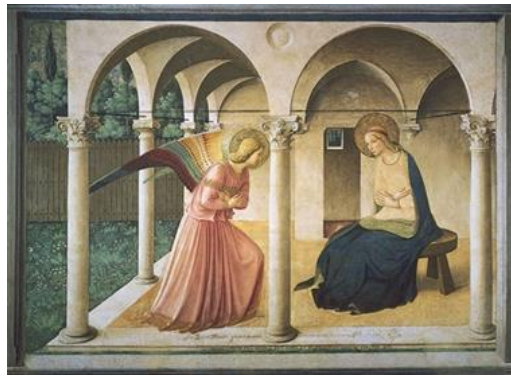
The Annunciation, Fra Angelico