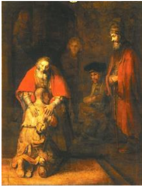
Return of the Prodigal Son, Rembrandt

If prayer is simply communication with God, and if there are millions of ways to communicate, then there are millions of ways of praying, and perhaps you've only just scratched the surface. Each of us responds differently to stimulus, so it is my hope that this might be yet another mode of prayer you might like to use to connect with the Creator of the universe. The richest method of prayer engages all the senses (hence the 'bells and smells' at Mass). So, for the ideal prayer experience and for best results, find a quiet place where you can be alone, away from external distractions. Visio Divina, Latin for Divine Seeing , is a form of prayer in which one meditates on sacred art.