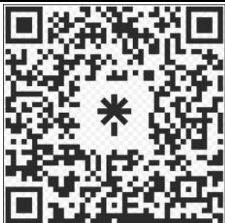
Linktree QR Code

Starting time: 10.30am. Refreshments will be provided during showcasing. Light lunch available from 12.30pm. To RSVP go to the Linktree QR code below or contact the parish office.