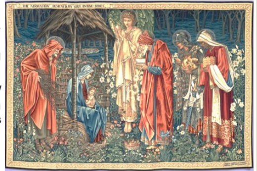
Adoration of the Magi, Edward Burne-Jones, 1904

Twelfth Night, a play written by Shakespeare in 1602, was a performance first written for production toward the end of the Christmas Season, highly likely to be presented as a twelfth night entertainment during the period between Christmas and the Epiphany.