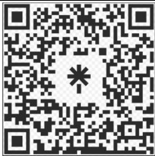
Linktree QR Code