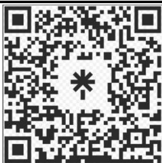
Linktree QR Code

All are invited to join our young adults for an hour of Adoration on Wednesday 13 th December, 6.30pm at the OLR church. We'd love to see you there!